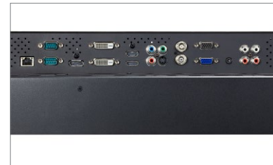
Multiple video inputs (VGA, DVI, HDMI, BNC, S-Video, DisplayPort and Component) allow for effortless system integration