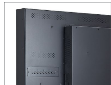
Durable metal casing for enhanced strength and secure mounting