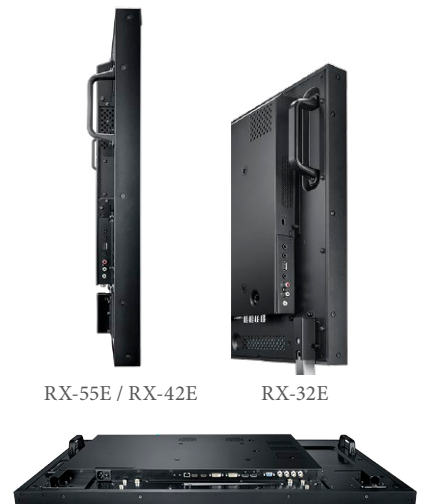
RX-55E / RX-42E