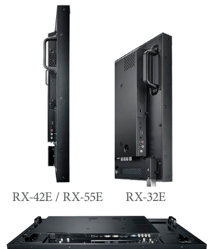
RX-42E / RX-55E