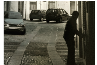
AG Neovo RX-Series